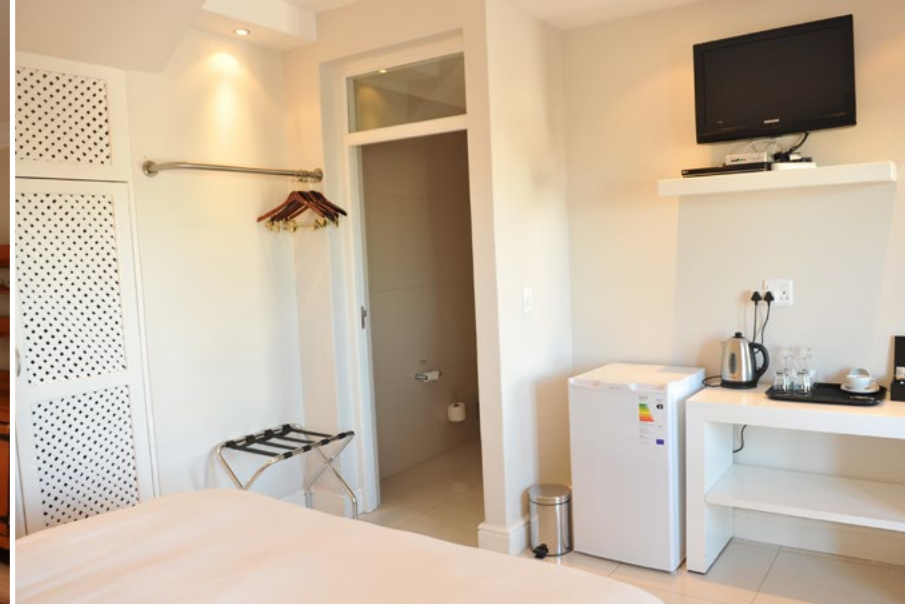
Camps Bay Resort