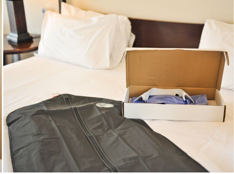
Camps Bay Resort