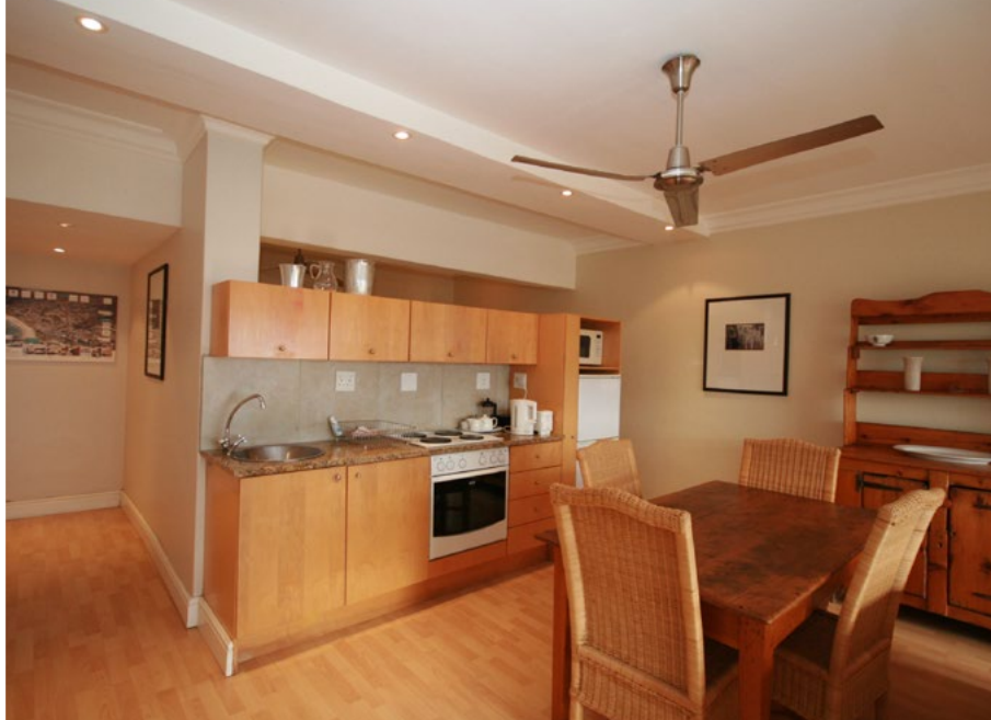
Camps Bay Resort