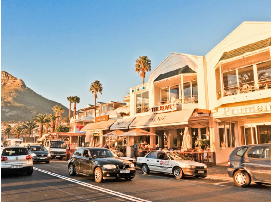
Camps Bay Resort