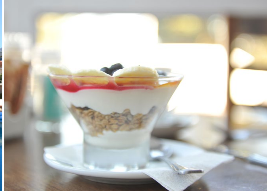
Camps Bay Resort